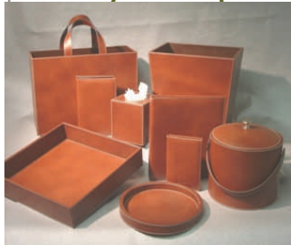
Custom leather products for the new Arrabelle at Vail