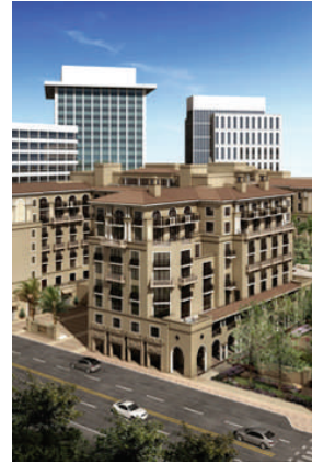
The Montage, Beverly Hills